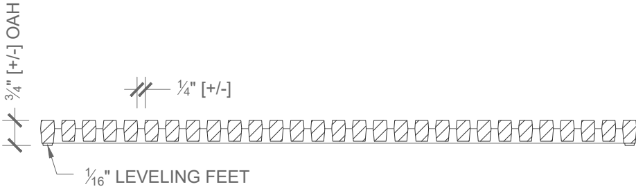
Cross Section Scale: 3" = 1' 0"